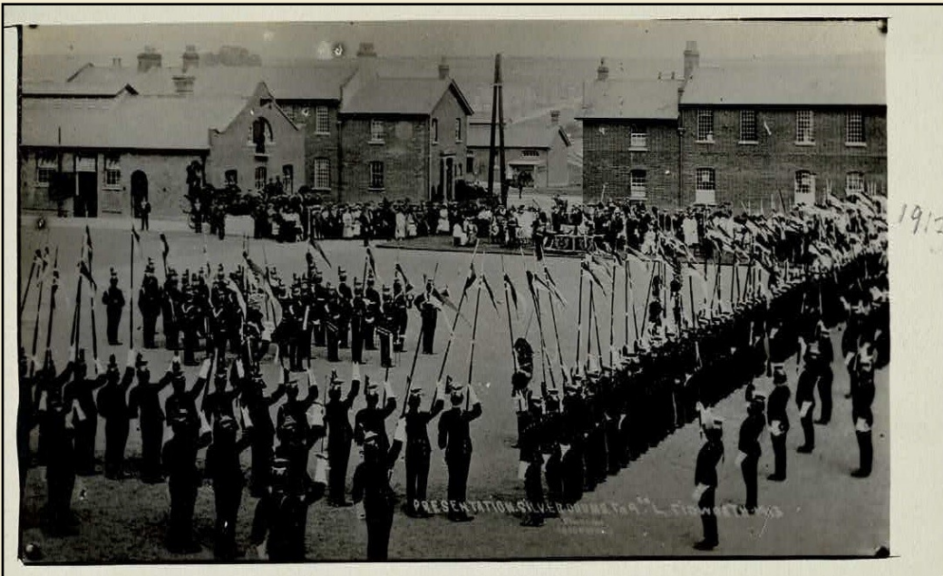
9th Lancers Tidworth Camp

let up in the level of activity soldiers coming to Tidworth - soldiers Leaving Tidworth. The bloated Tidworth military population was further enlarged by hundreds of Australian ,Canadian and New Zealand soldiers from their camps at Bulford. From the desolation of Bulford Tidworth appeared as a city of "Bright Lights" and so to Tidworth they flocked. The hustle and bustle came to an abrupt end with the Declaration of Armistice of November 11th 1918. Tidworth Garrison had stood the test, that conditions of War had imposed on it with distinction.